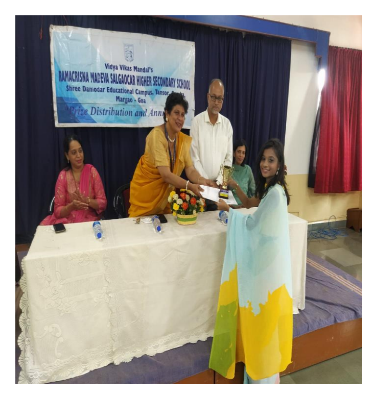
Studious student of the year 2021-22

The Annual Prize Distribution Function was held on 12<sup>th</sup> March, from 1.00 pm to 2.30 pm in the Ganesh Daivajna Auditorium.