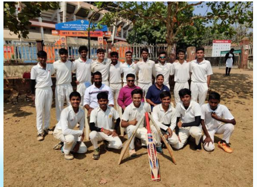
Finalists at State level U-19 Cricket tournament organised by DSYA

Sports make the child physically, mentally and emotionally strong to deal with life situations in a healthy manner. The school provides excellent facilities for indoor and outdoor games. The students are encouraged and coached to take part in games of their interest at various levels such as Inter Higher Secondary Level, Zonal Level, State Level, National Level and International Level sponsored by Directorate of Sports and Youth Affairs, Panaji Goa.